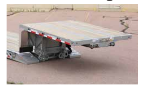
Full-Width Mechanical Gooseneck (Standard)