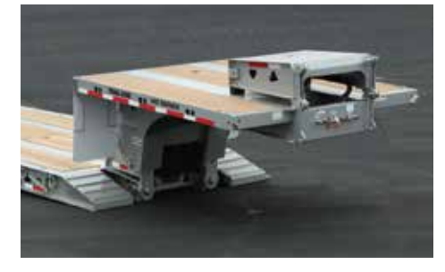
Full-Width Hydraulic Gooseneck (Shown with optional flip neck)

Trail King's Commercial MED-HED Detachable Gooseneck Double Drop Extendable trailer comes loaded with the most standard equipment of any trailer of its kind on the market... as well as a variety of options, including lightweight, corrosion-resistant aluminum features.