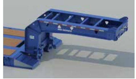
Narrow Mechanical Gooseneck