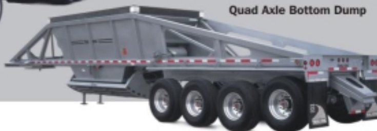
Quad Axle Bottom Dump