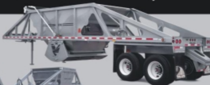
Switch Gate Bottom Dump