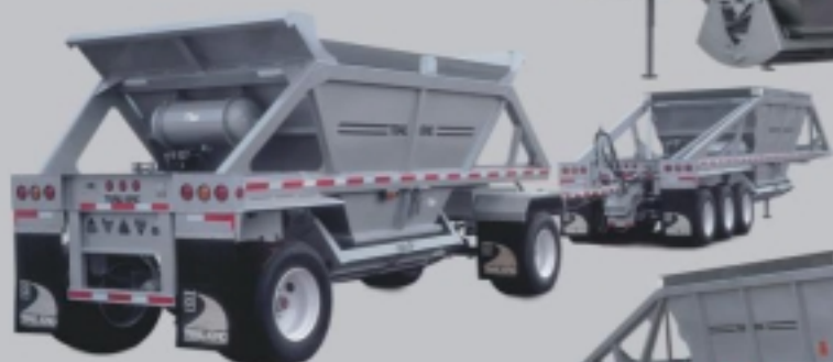
Bottom Dump Trains