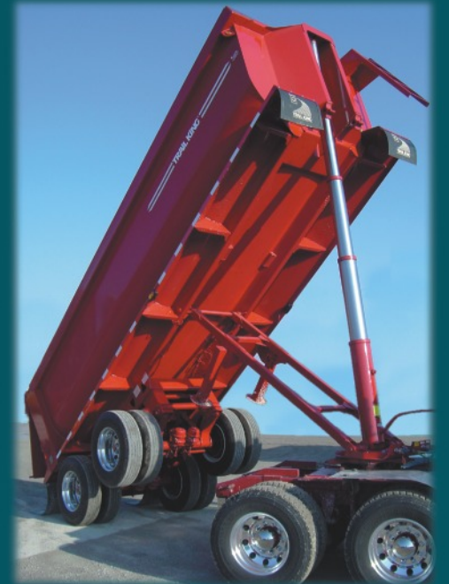
Frameless Steel Tub Dump Trailer