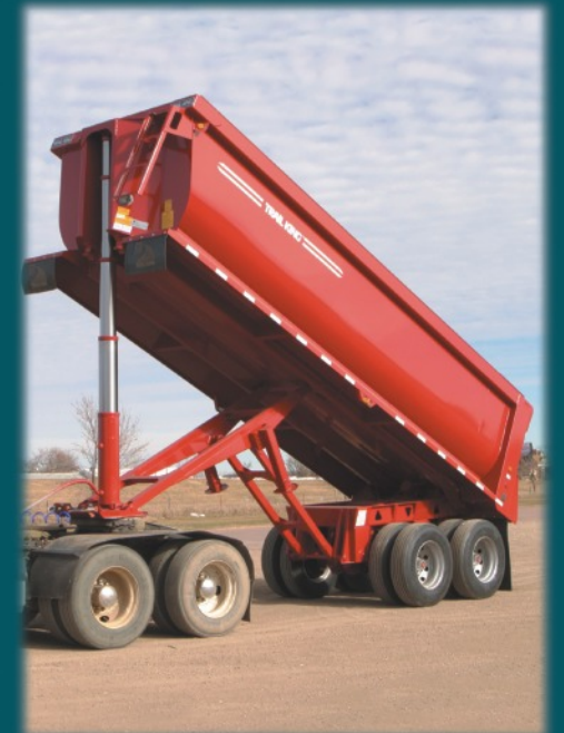
Quarter Frame Steel Tub Dump Trailer