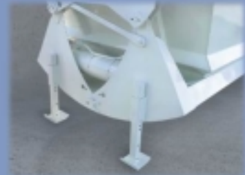
Pin-Style Landing Legs