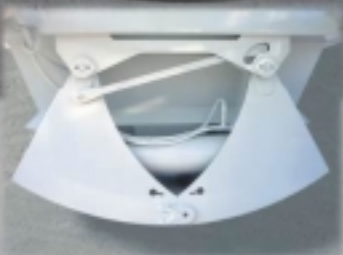
Chrome-Bushed Spherical Bearings on the ends of the gate equalizer arms reduce wear and ensure long, trouble-free service life.