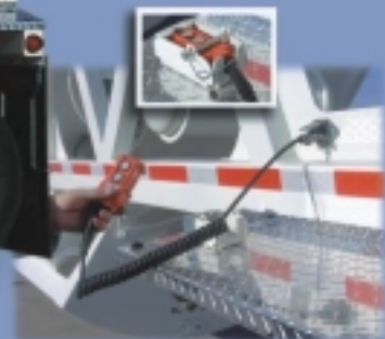
Remote Variable Control