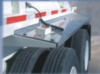
Full-Width Aluminum Fenders, both front and rear, are sloped to shed material more effectively.