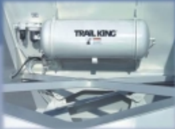
Large Air Reservoir, with air system oiler, means longer operating time and better control.