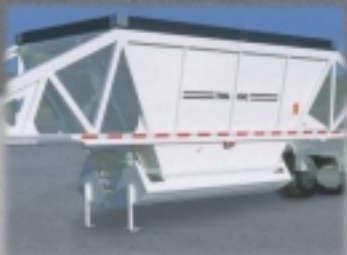
Large 12' Gate and 60" x 106" hopper opening, combined with nearly vertical hopper walls, delivers complete dumping of even the stickiest materials.