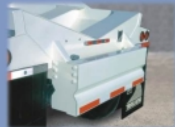
Bolt-On Push Block