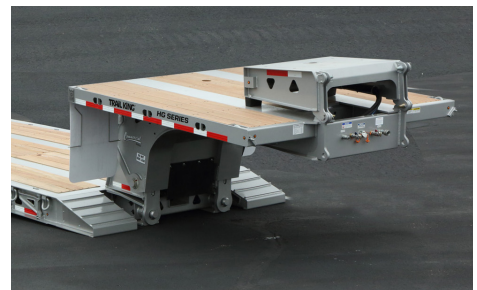
Full-Width Hydraulic Gooseneck (Shown with optional flip neck)

Trail King's Commercial MED-HED Detachable Gooseneck Double Drop Extendable trailer comes loaded with the most standard equipment of any trailer of its kind on the market... as well as a variety of options, including lightweight, corrosion-resistant aluminum features.