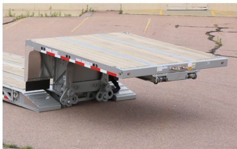
Full-Width Mechanical Gooseneck (Standard)