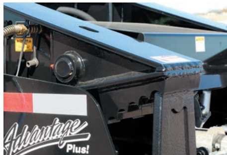
Adjustable Arch Gooseneck